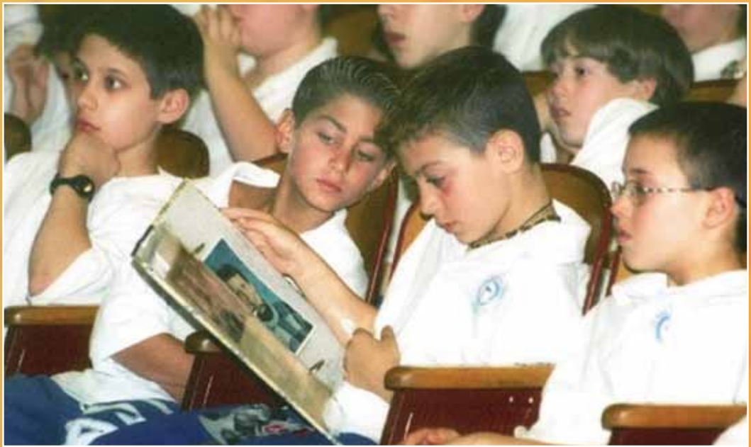
Students listening to The Courage To Speak® presentation. The program has taught the dangers of drugs to many children.

Sunny's Story and signing will be available at this event!