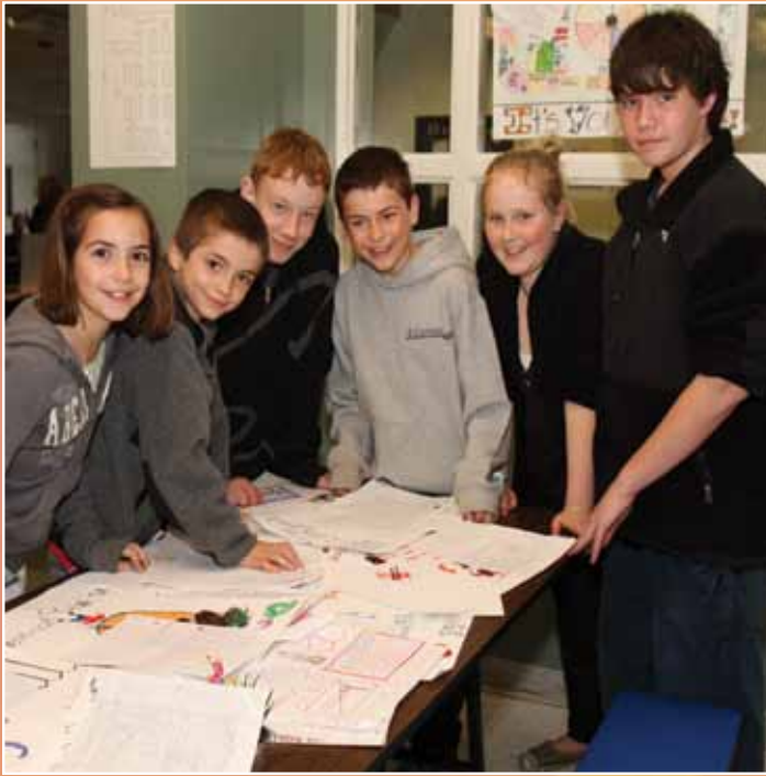
Students standing proudly around their anti-drug posters they created in their seventh grade classroom with the Courage to Speak drug prevention curriculum.

Tuesday, March 20th, 2012 • 5:15pm Snow Date March 21 West Rocks Middle School 81 West Rocks Road, Norwalk