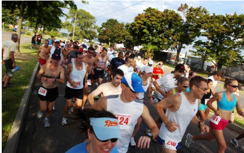
The Hour Newspaper Photo by Eric Trautmann